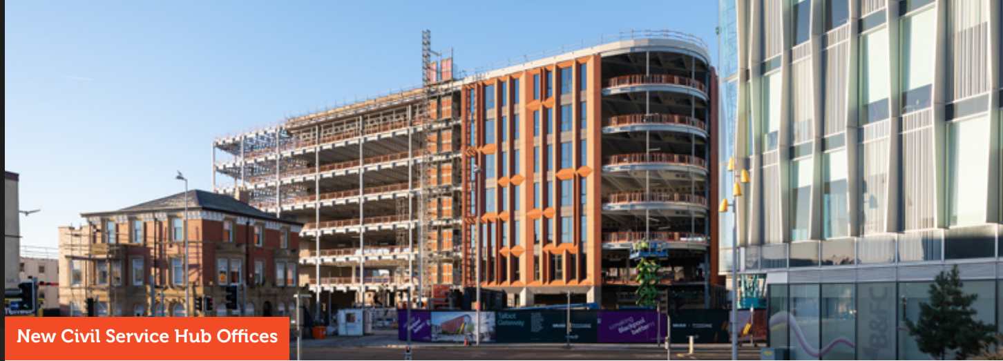
New Civil Service Hub Offices

Now on phase five, the overall scheme is bringing at least 8,000 professional workers and students in to Blackpool town centre.