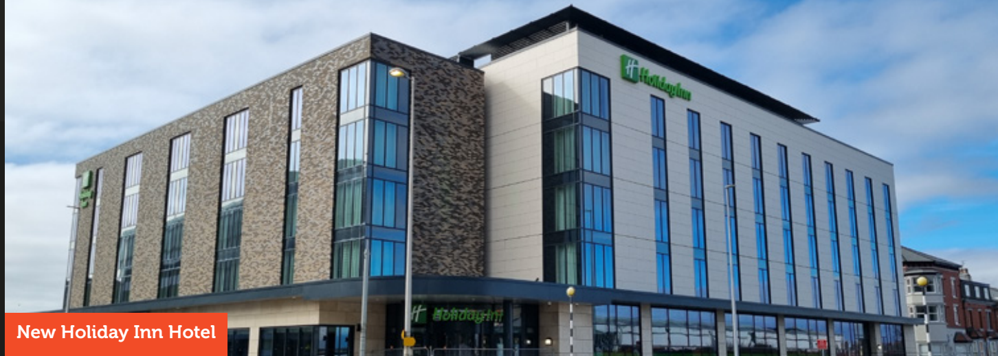
New Holiday Inn Hotel